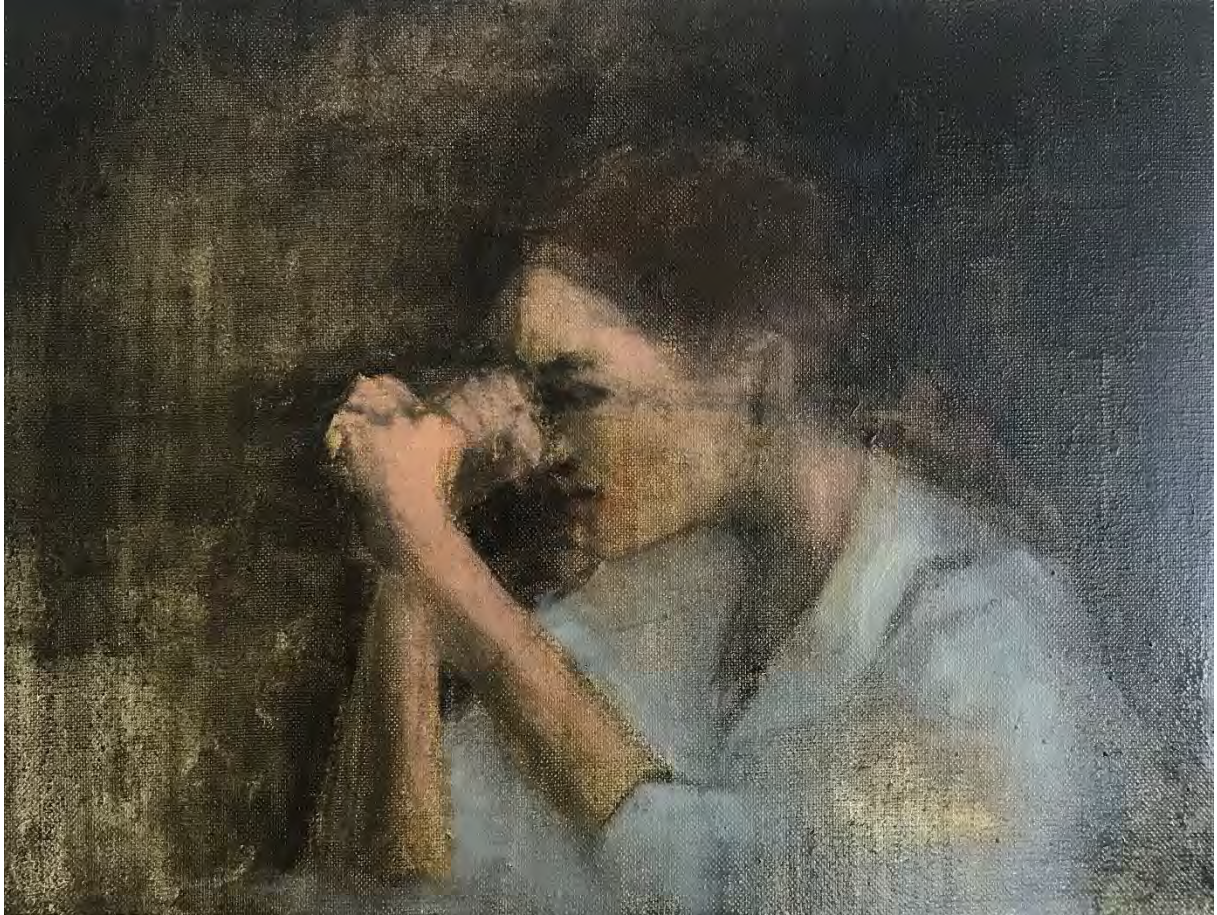
Kristine Narvida: Look how I move 4 / Oil on linen, 30 x 40 x 3 cm, 2021