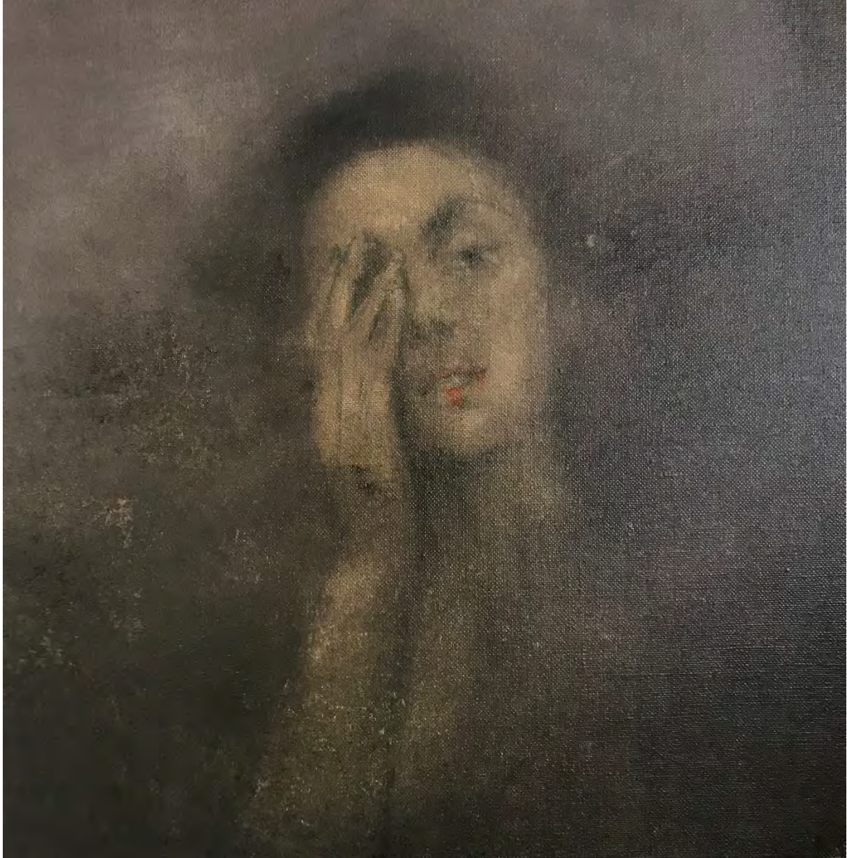
Kristine Narvida: Look how I move 5 / Oil on linen, 40 x 40 x 3 cm, 2021