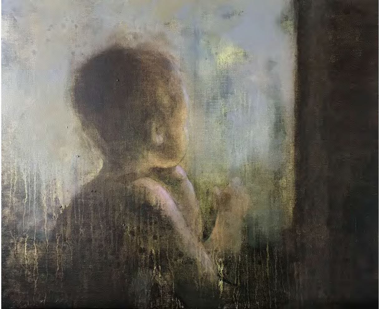
Kristine Narvida: Look how I move 2 / Oil on canvas, 40 x 50 x 3 cm, 2021