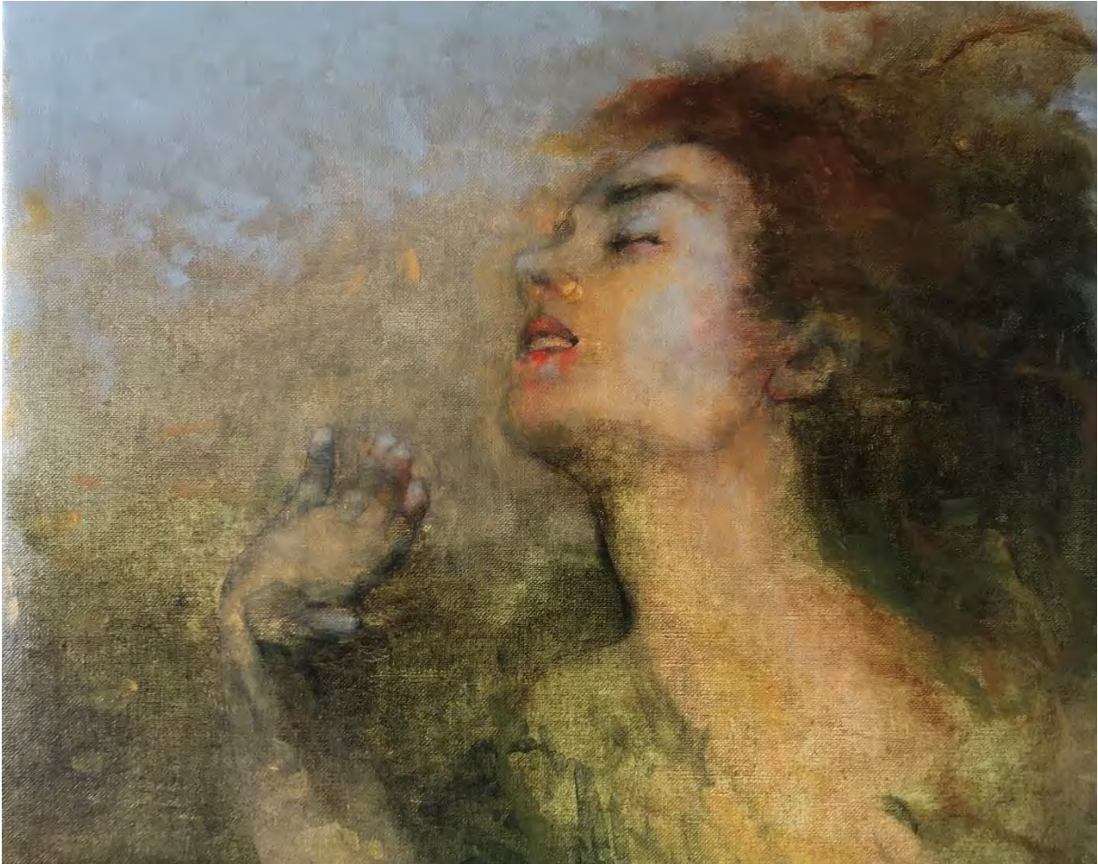
Kristine Narvida: Look how I move / Oil on canvas, 40 x 50 x 3 cm, 2021