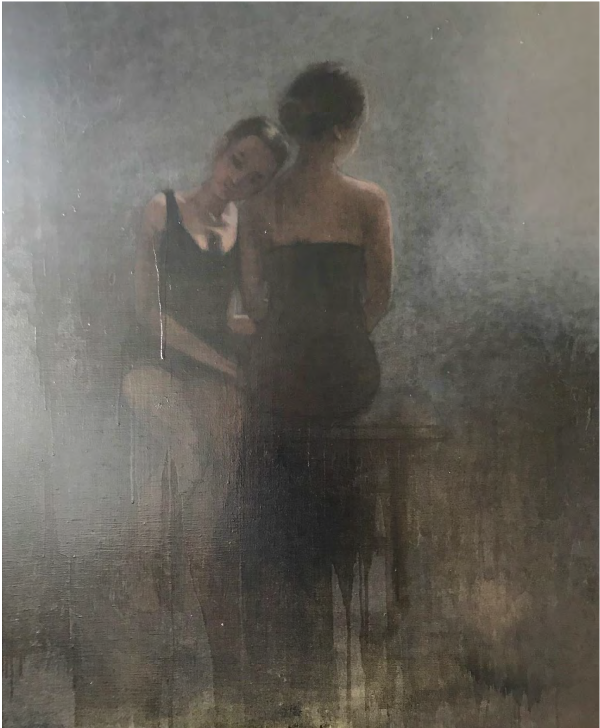
Kristine Narvida: Look how I move 10 / Oil on linen, 120 x 100 x 2 cm, 2021