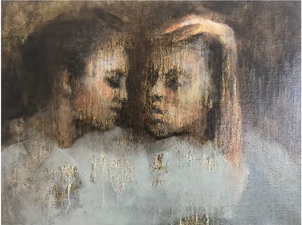
Kristine Narvida: Look how I move 3 / Oil on linen, 30 x 40 x 3 cm, 2021