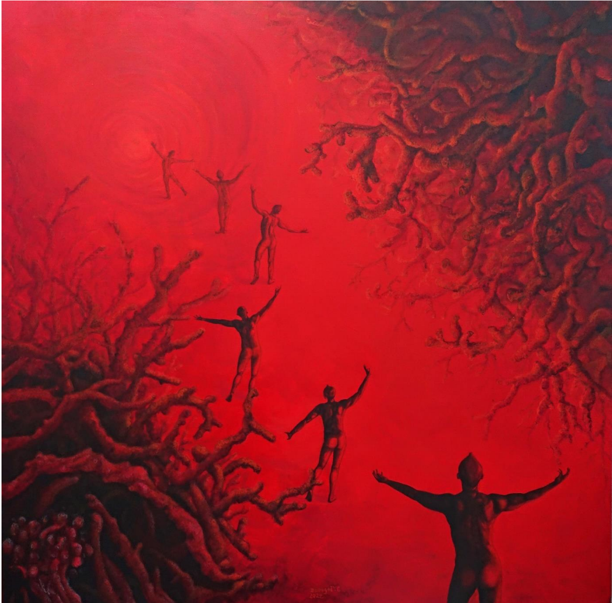
Donegel' Chong: Krappwurzeln: Im Rot baden / Acrylic on linen, 100 x 100 cm, 2022