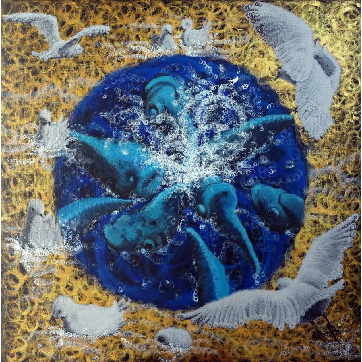
Donegel' Chong: Feeding Air Water / Acrylic on linen, 100 x 100 cm, 2021