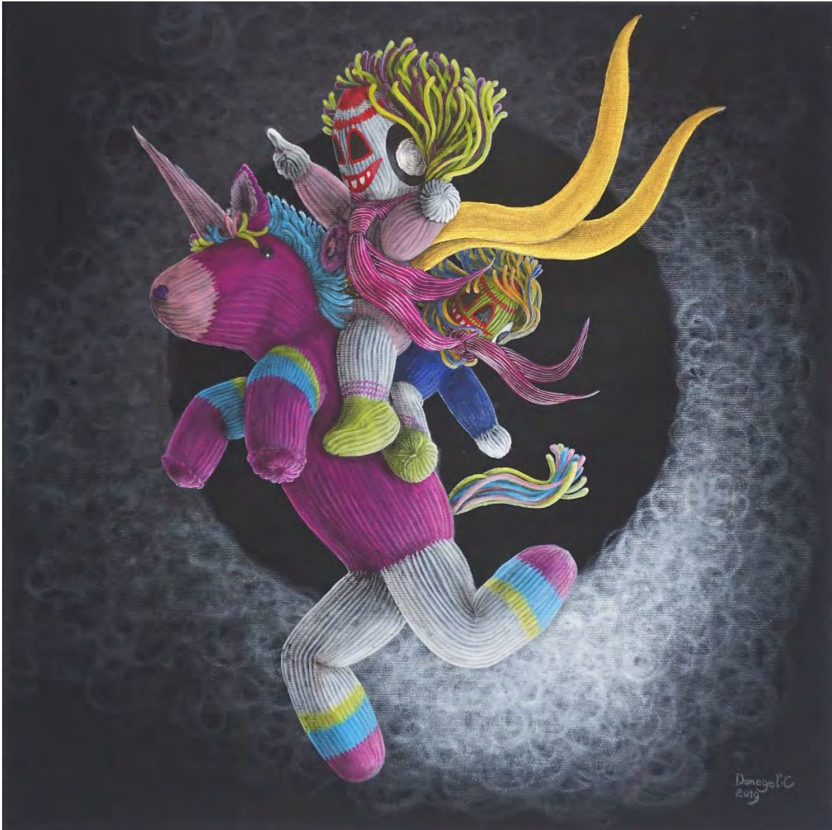
Donegel' Chong: Erika's Waggis Volume 2: Ampa Rai & Baby: Ever After / Acrylic on canvas, 60 x 60 cm, 2019